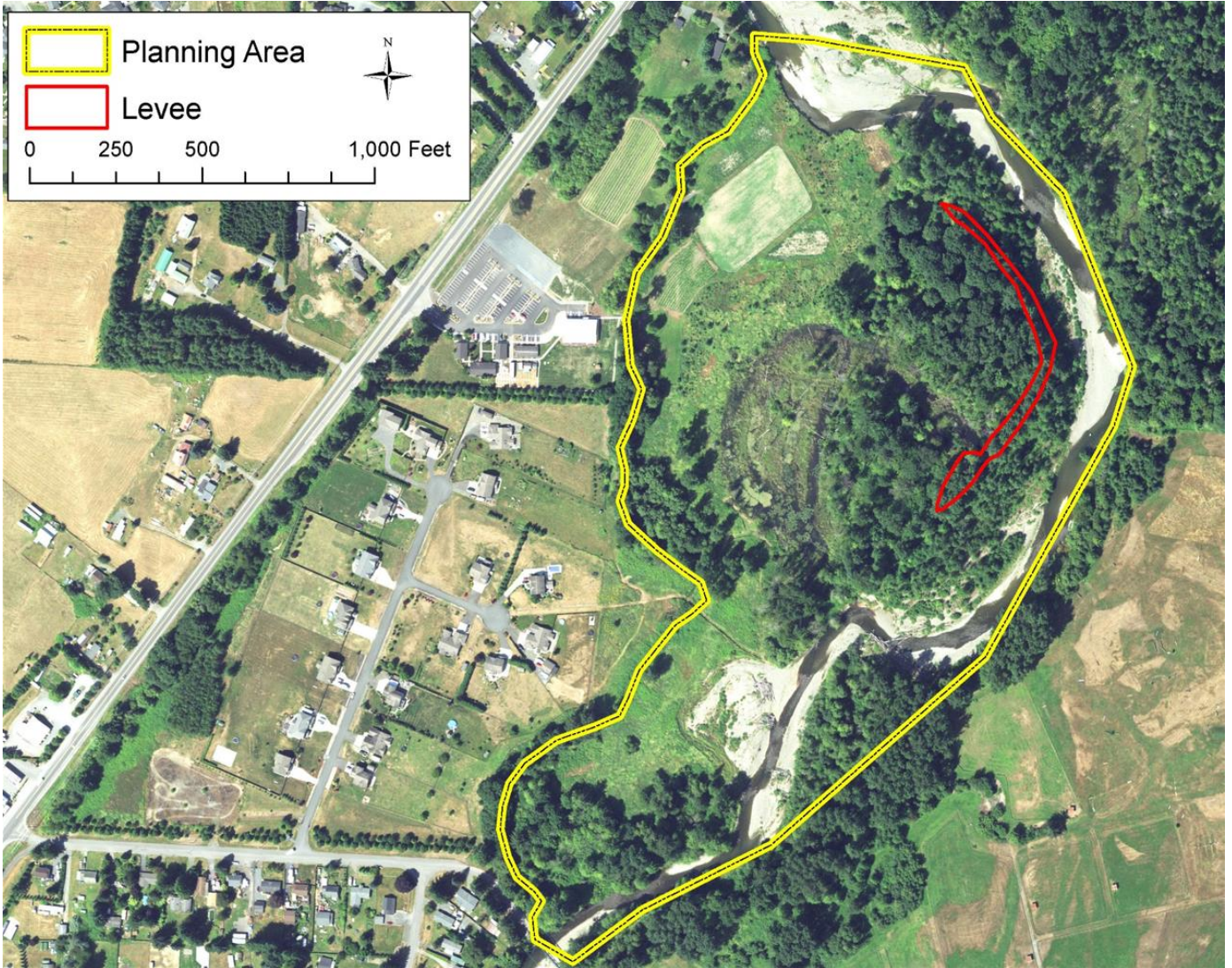
Figure 1. The Full Project Area for the Lochsloy Floodplain Design Project.