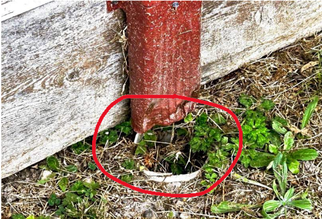
EXHIBIT 5 Existing Facility Information