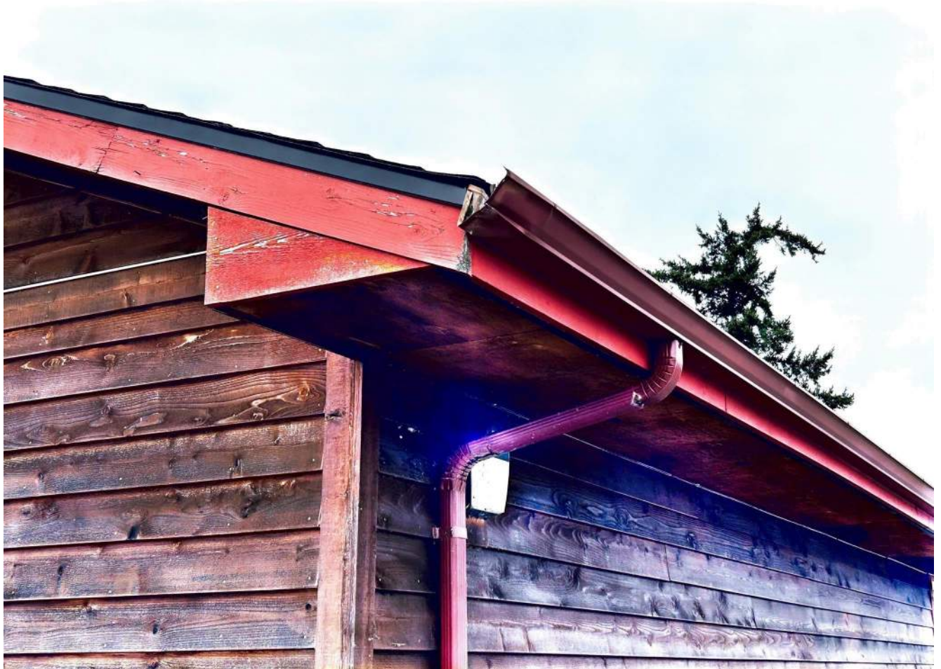
RFP for Siding Re-Stain & Gutter Replacement Kenny Moses Building